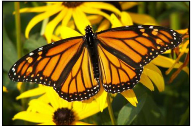
Female Monarch Butterfly