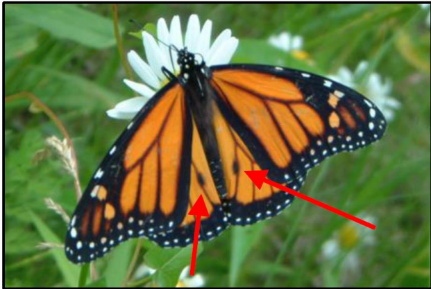
Male Monarch Butterfly