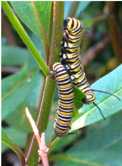
Monarch caterpillars feed on tropical milkweed.