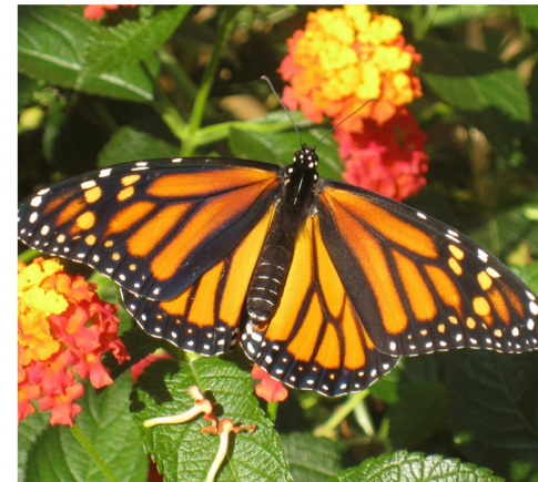
A female monarch butterfly rests on a nectar plant. Monarch butterflies are known for their distinctive coloring: bright orange wings laced with black veins and bordered by a black edge with white dots.