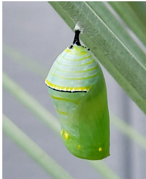
A monarch butterfly chrysalis. Caterpillars inside the chrysalis eventually emerge as butterflies.